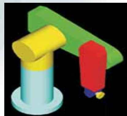
Controlled Motion of Puma Robot