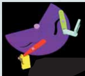
Air Plenum Door Operating Mechanism

A general purpose program for static, kinematic, and dynamic analyses of constrained multibody mechanical systems undergoing large, nonlinear, three-dimensional displacements. DYMES/Control has been integrated with DYMES for controlled mechanical system simulations.